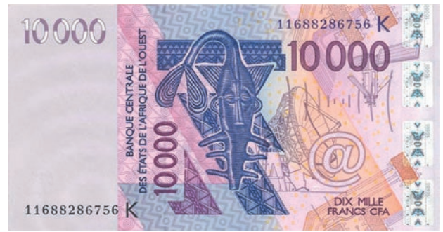
10,000 CFA franc banknote from the BCEAO